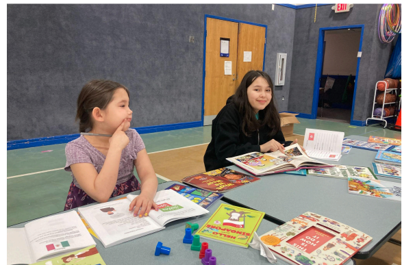
Two students working on their passports

Clark's Point did an Around the World Night. Looking at countries from every continent except for Antarctica we put together a passport. The students then had to fill out the books with information found in books and on the internet, as well as look at a map to see where different countries and cities were located. Each country had the same information students needed to fill out; capital, money, holidays, food, continent.